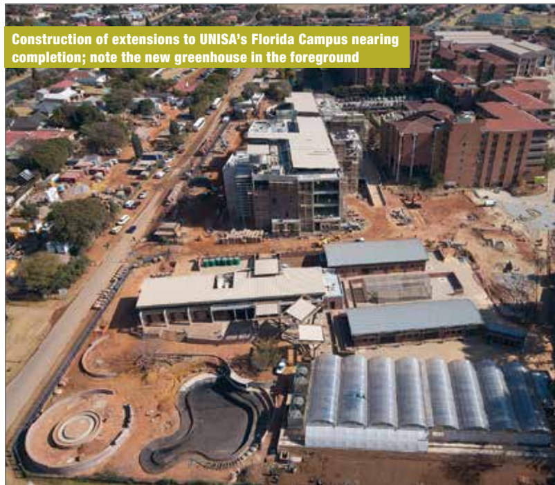
Construction of extensions to UNISA's Florida Campus nearing completion; note the new greenhouse in the foreground

Requests by the client for structures to have high load capacities were adequately attended to. RHDHV successfully managed the design, documentation, tender and contract administration for all engineering services. This complex and challenging project was completed successfully and handed over in December 2012. □