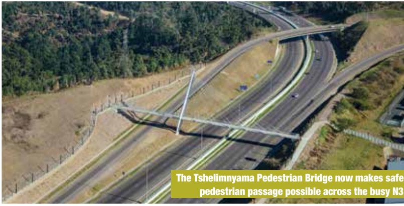
The Tshelimnyama Pedestrian Bridge now makes safe pedestrian passage possible across the busy N3

Structurally sound design principles resulted in an elegant and functional pedestrian bridge