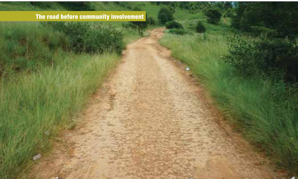
The road before community involvement

The slotting method, using a tape, poles and fish-lines, was used for the